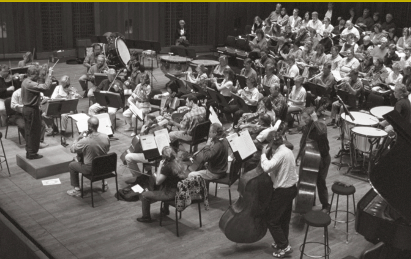
Hugh Wolff rehearsed the Saint Paul Chamber Orchestra in 1998 as students in the adult education series, Musical U, followed the score on stage.