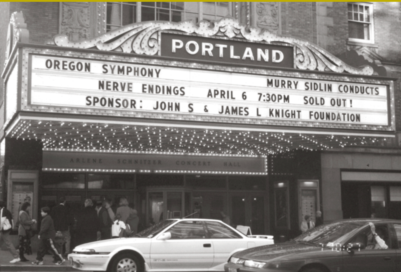
In April 1999, a marquee in Portland told the story of the Oregon Symphony's performance as part of its Nerve Endings series.