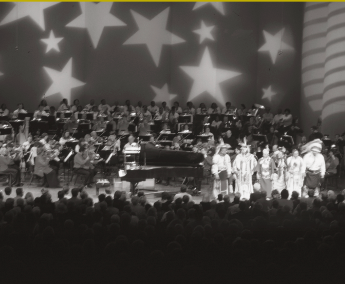
The Wichita Symphony performed as part of its Sound Waves series in November 2003.