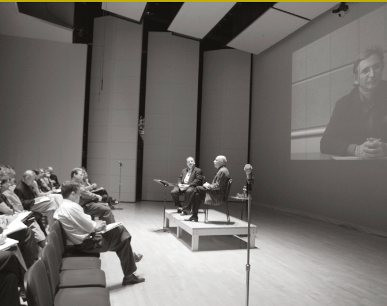
New World Symphony music director Michael Tilson Thomas, looming over the stage, spoke via Internet2 technology at the Magic of Music retreat in Miami Beach in January 2005.