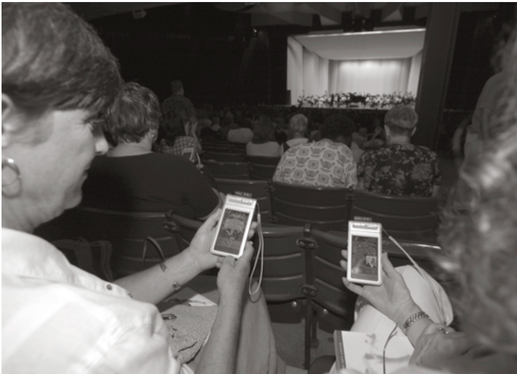
The Concert Companion PDA was developed as part of the Magic of Music by the Kansas City Symphony.