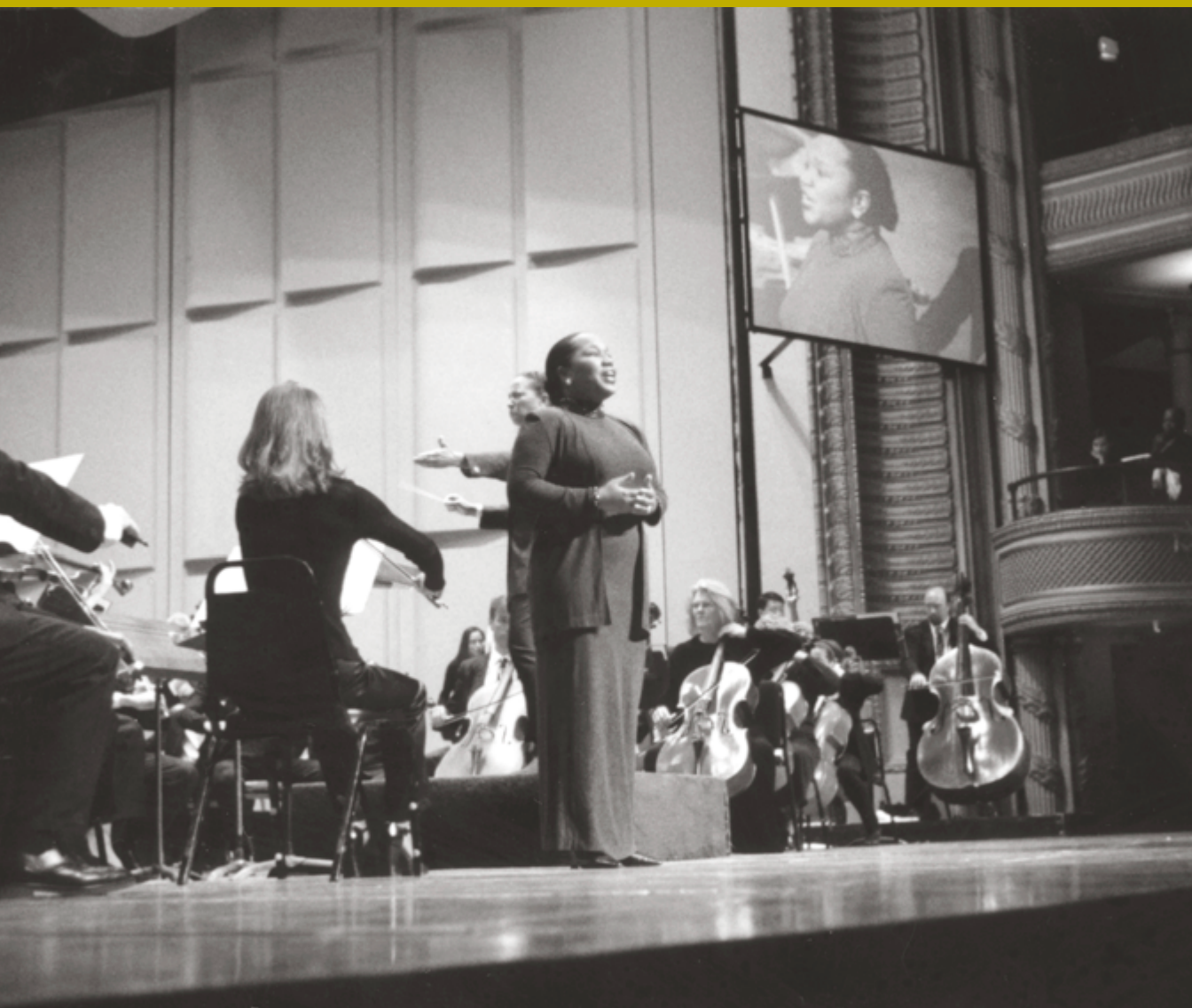
In 1998, the Louisiana Philharmonic Orchestra's Connections series was enhanced by onstage video.